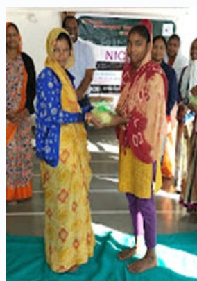
સાબરમતી સમૃદ્ધિ સેવા સંઘ દ્વારા સરકારી યોજનાઓની જાણકારી માટે તાલીમ