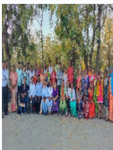
World Migrant Day Celebration