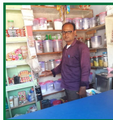
Start life anew