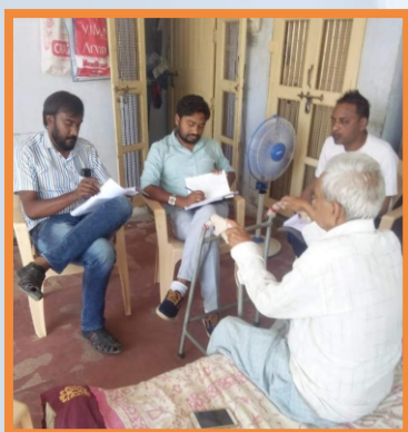
Initial home visit